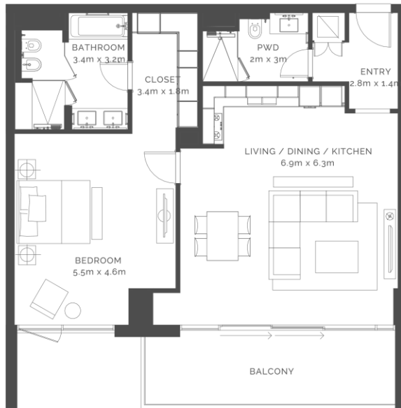
Plot key plan

Average Internal Area 104m 2 Average Balcony Area 44m 2 Average Total Area 148m 2 *